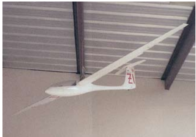
The Large-Scale Applebay Zuni Model