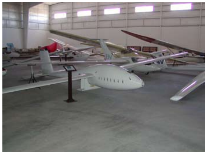
NASA's APEX PROJECT

The Museum has recently acquired a research glider which was central to NASA's Apex Project. The following information on the project was downloaded from NASA's website on the internet.